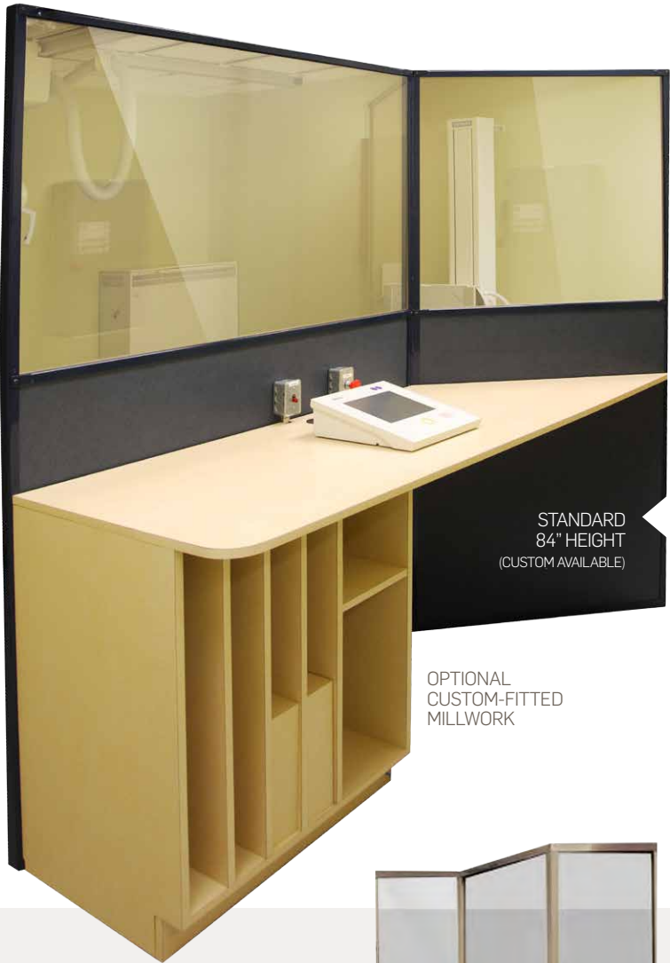
STANDARD 84" HEIGHT (CUSTOM AVAILABLE)